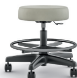
Physician / Exam Stool with Footring