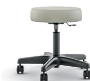
Physician / Exam Stool