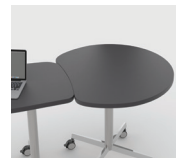
Nested Utility Table