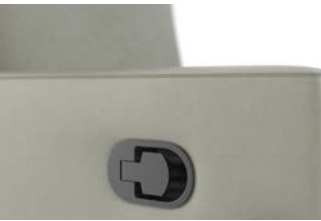
Back Release Lever