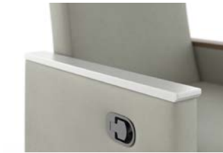
Solid Surface Arm Cap