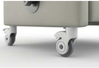
Individual Locking Caster