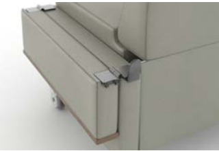
Drop Arm Released