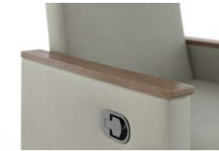
Wood Arm Cap