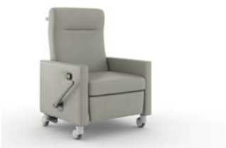
Central Locking with Trendelenburg