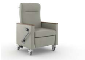
Individual Locking with Trendelenburg