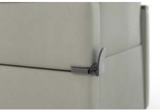
Drop Arm Release Lever