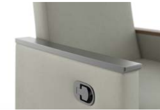
Polyurethane Arm Cap