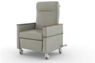
Central Locking with Drop Arm