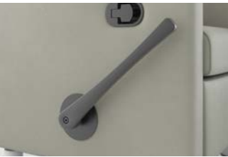
Footrest Release Lever