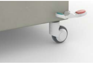
Central Locking Caster Paddle