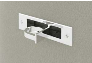
Utility Bag Hook