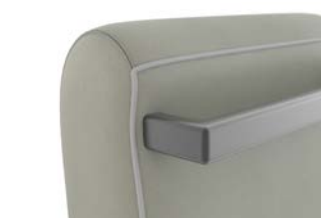
Bump Guard (protective welt cord)