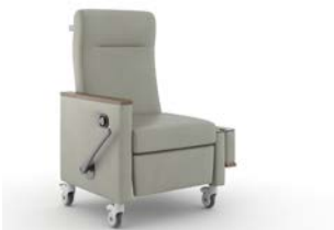
Individual Locking with Drop Arm