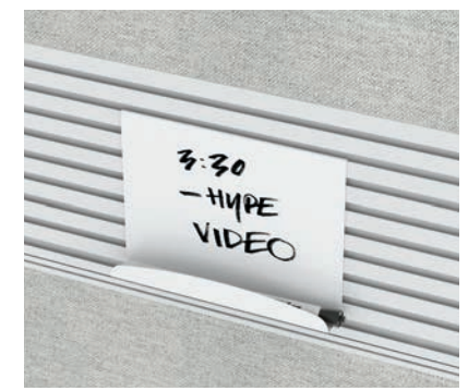
Dry-Erase Markerboard with Tray