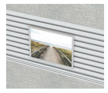
8x10 Picture Frame