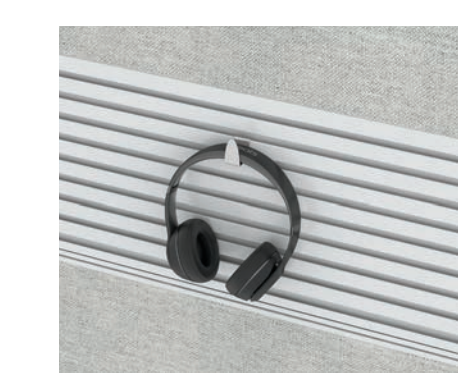
Ear Phone/Bud Holder