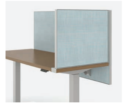
Side Privacy Screen