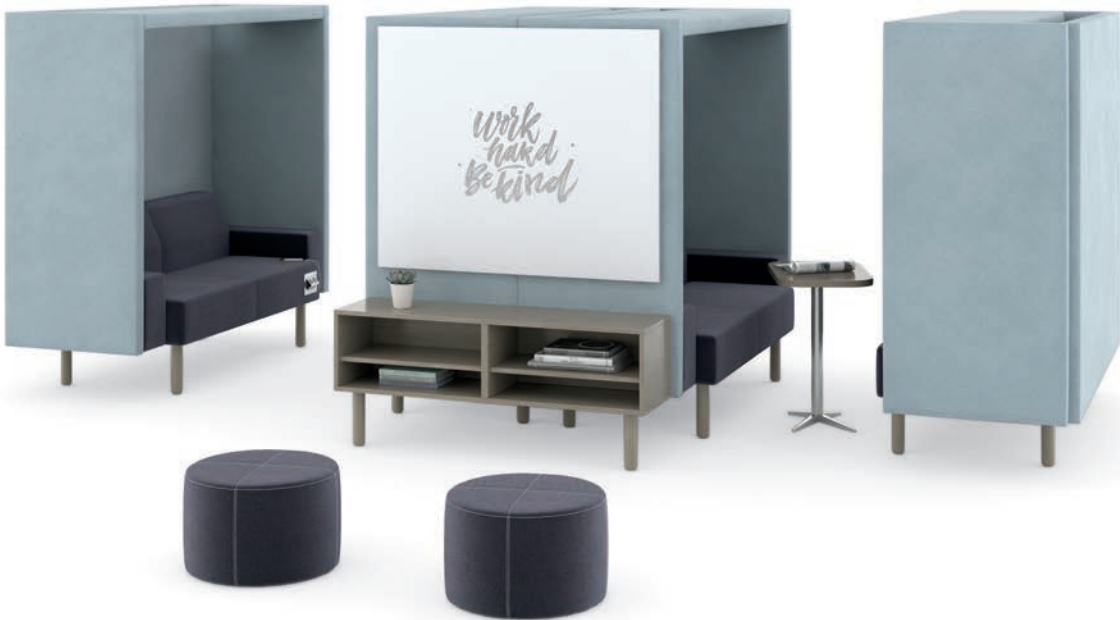
Inside and Out Pairings Nook allows for quiet meeting spaces inside while also providing a collaborative space outside—storage and markerboards support your meeting needs.