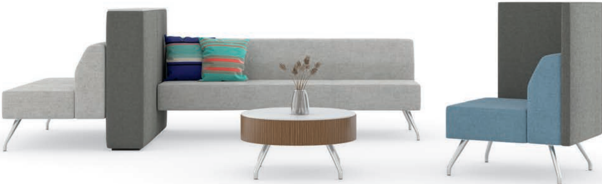
Space and Time Components connect to create a welcoming space within an open setting.