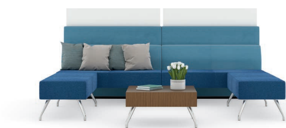
Casual Vibe Form a social space for private meetings or casual socializing.