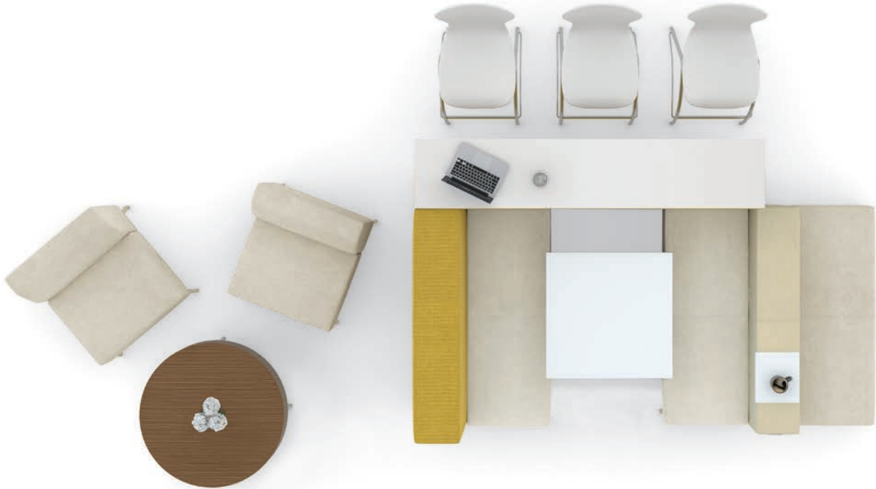
Divide And Conquer (pictured above and below) A blend of seating supports individual work and seamless collaboration. By integrating a divider wall, one meeting space becomes many.