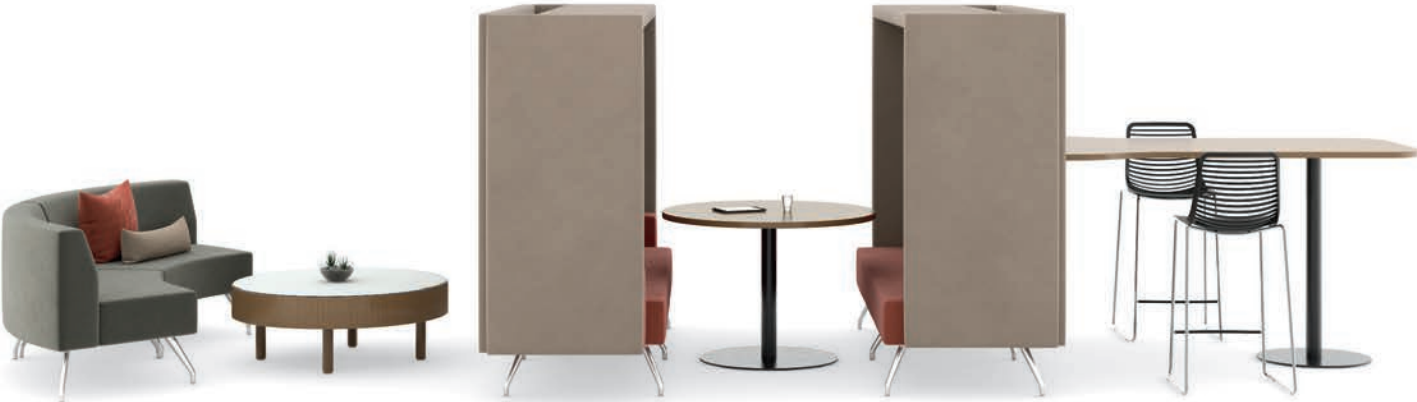
The Anchor Pairings Nook supports a range of gathering spaces, from casual to standing while allowing for a respite in the open work environment.