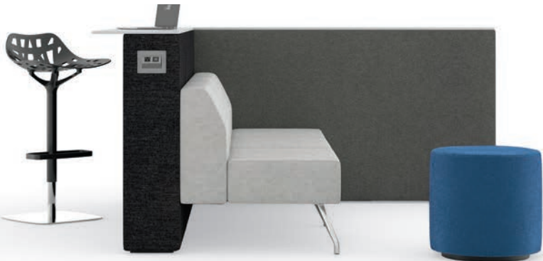
On the Shelf A divider wall takes on a new dynamic with a work shelf for casual, standing meetings.