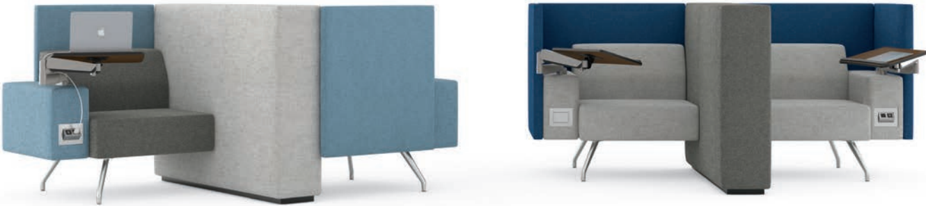
Mix it Up Individual seats can be arranged in multiple ways with the support of a divider wall. Adding a tech arm provides a personal, adjustable worksurface.