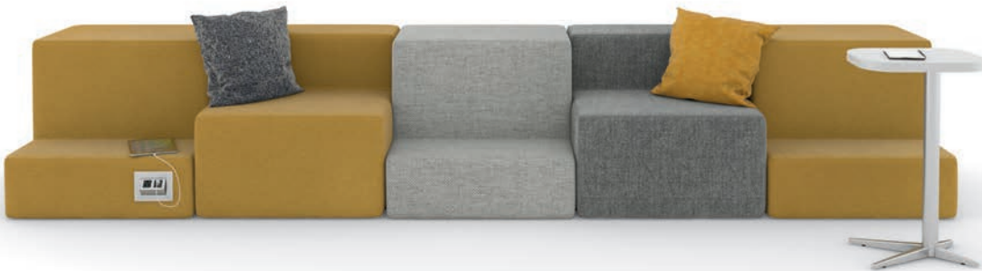
Alter your Style Need a creative solution for a small area of space? Stagger layers of seating for endless options in any space; large or small.