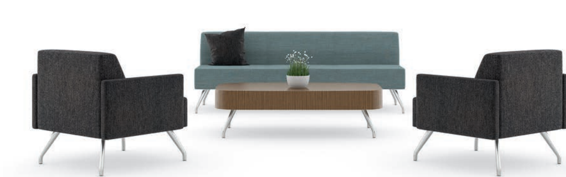
Lounge Around A basic lounge setting emphasizes comfort during face-to-face gatherings.