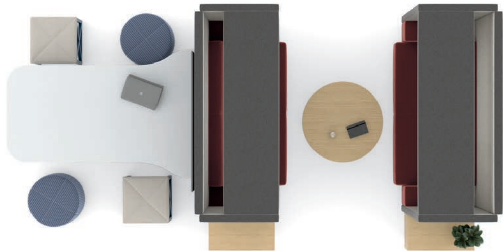
Dual Purpose (pictured above and below) Whether its individual downtime or a semi-private space for gathering, Pairings Nook supports the need within one small footprint. Opening at top allows for light to flow through.