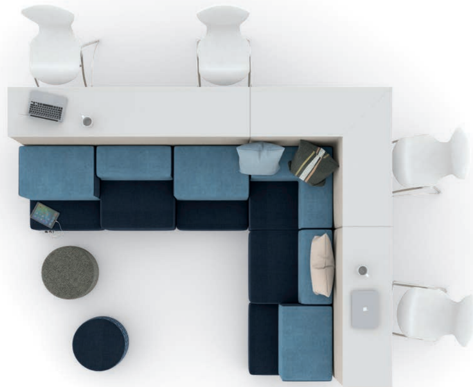
Define the Space (pictured above and below) Mix and match fabrics and incorporate technology for a fun yet functional informal gathering area.