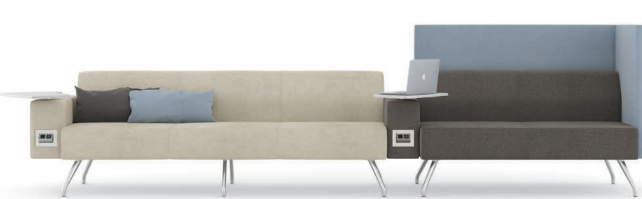
Long and Lean Privacy panels create an isolated retreat in an open setting. A tablet arm option and power add a functional dynamic.