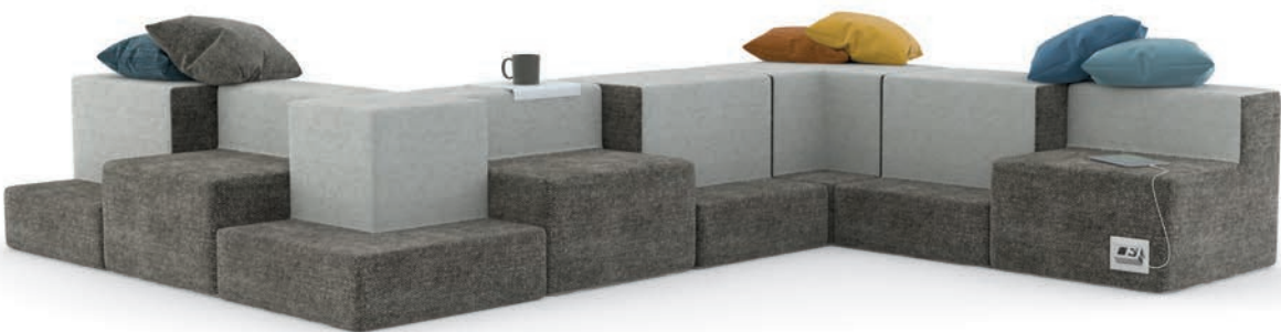
All in the Open Low, Mid and Corner sections easily come together to create configurations that fit any open plan setting.