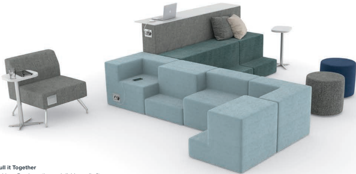
Pull it Together Pairings Perch seating and divider walls fit together nicely to create separate, yet joined areas within a space.