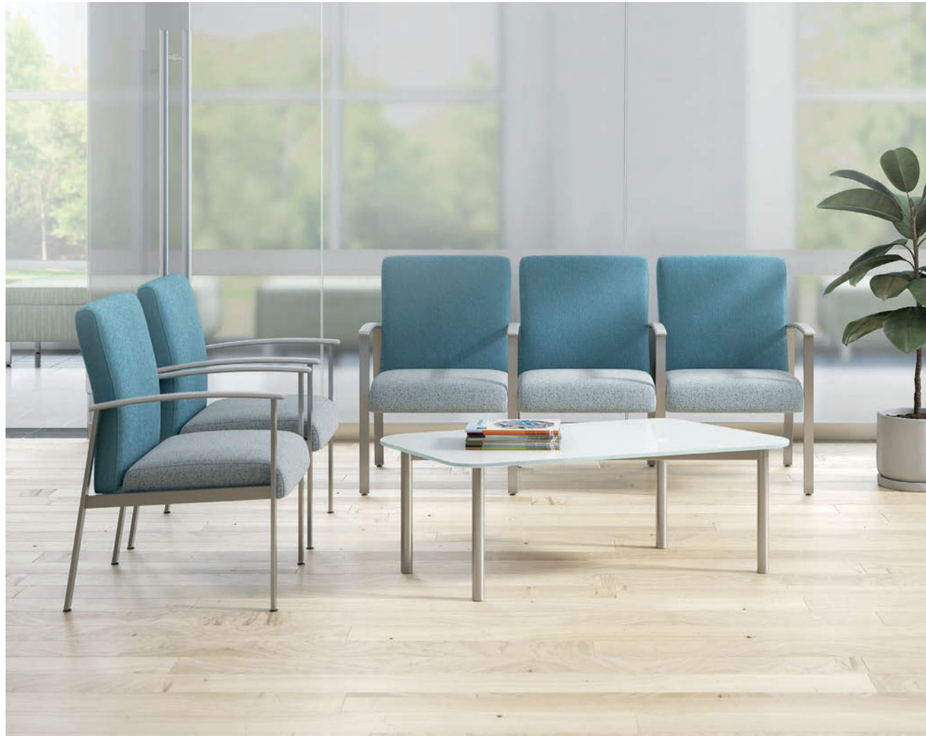
Sycamore Metal meets the quality and comfort of Sycamore with the durability of metal. The Sycamore Metal collection includes guest, tandem, bariatric and patient seating options.